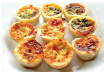
Pastry Platter $110

A mouth-watering assortment of gourmet cheeses and crackers will tempt your guests, and will feed up to 12 – 15 people.