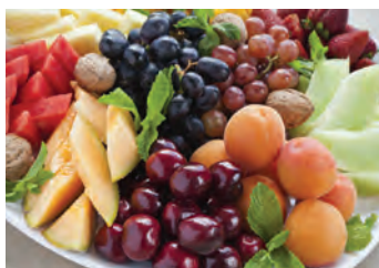
Fruit Platter $170

A tasty and delicious assortment of seasonal fruits will be artfully plated and will feed up to 12 – 15 people.