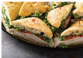
Sandwich Platter $110

A selection of sweet and savoury treats including ham and cheese croissants, banana bread, muffins and biscuits will be served. Will feed up to 12 – 15 people.