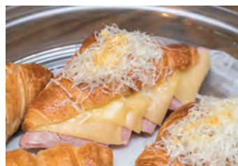
Breakfast Platter $110

A tempting selection of delicious home-baked Mini Meat Pies, Mini Shephard's Pies, Mini Cornish Pasties, Mini Cheese and Onion Pies accompanied with Dipping Sauce.