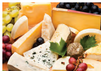
Cheese Platter $170

A tasty and delicious assortment of seasonal fruits will be artfully plated and will feed up to 12 – 15 people.