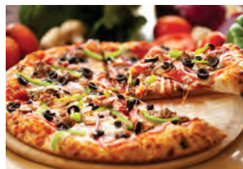
Woodfire Pizza Combo $30 / person

A delicious mix of sandwich bread with assorted fillings *gluten free options available $10.00